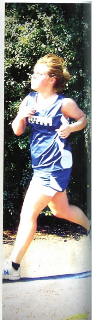
Cross Country 113 Track 121